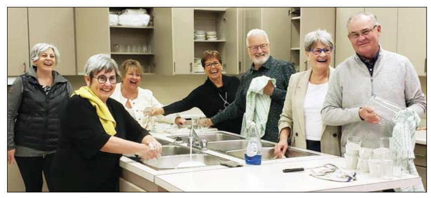
Bethel United Church members volunteering in the kitchen during the Moosomin Food Share fundraising dinner.