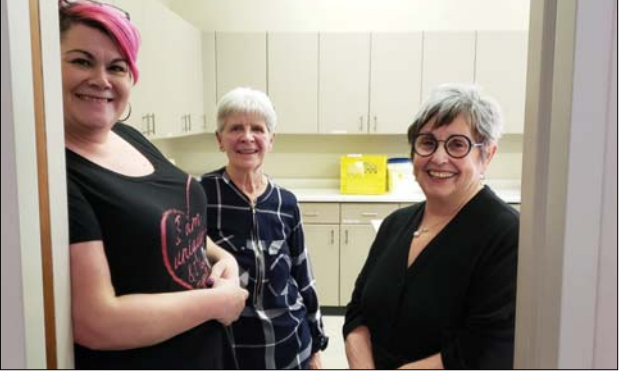
Bethel United Church members at the Bethel United Church Moosomin Food Share Fundraising Dinner in March.