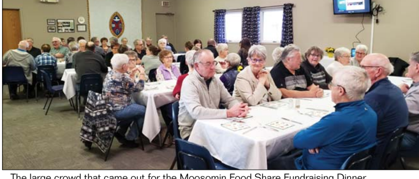
The large crowd that came out for the Moosomin Food Share Fundraising Dinner.

from our own congregation. The variety of lay ministers creates a mixture of viewpoints—each being unique and interesting in their own way.