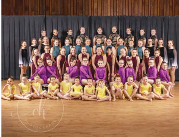
A photo of all of Bohemka's groups together. Back row is the Performing Team, second row from back is the Senior Team (black and white outfits) and Junior team (teal outfits), third from the back is a Junior Team, second from front is the Intermediate Team, and in the front is the Beginner Team.

If you have any questions, please email us at bohemkagymnastics@hotmail.com or you can also find us on Facebook and