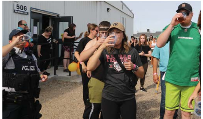
The runners chugging their first beers before setting off.

The first ever Moosomin Beer Mile run was held on Saturday, September 7. The event was a fundraiser for Playfair Daycare for the construction of an additional facility in Moosomin. Hosted by Playfair Daycare, Iron Prairie Strength Lab, and Skout Brewing, the event required runners to walk or run one mile drinking a beer (or non alcoholic option) every quarter mile. People could register as individuals or in teams of two or four. The event started at Iron Prairie Strength Lab and ended at Skout Brewing.