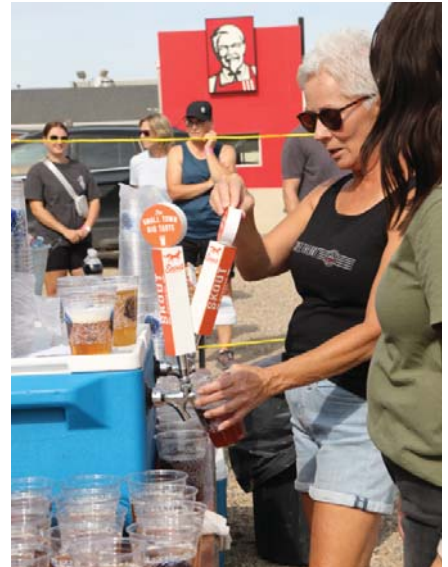
Skout Brewing draught being poured for the runners.

The first ever Moosomin Beer Mile run was held on Saturday, September 7. The event was a fundraiser for Playfair Daycare for the construction of an additional facility in Moosomin. Hosted by Playfair Daycare, Iron Prairie Strength Lab, and Skout Brewing, the event required runners to walk or run one mile drinking a beer (or non alcoholic option) every quarter mile. People could register as individuals or in teams of two or four. The event started at Iron Prairie Strength Lab and ended at Skout Brewing.