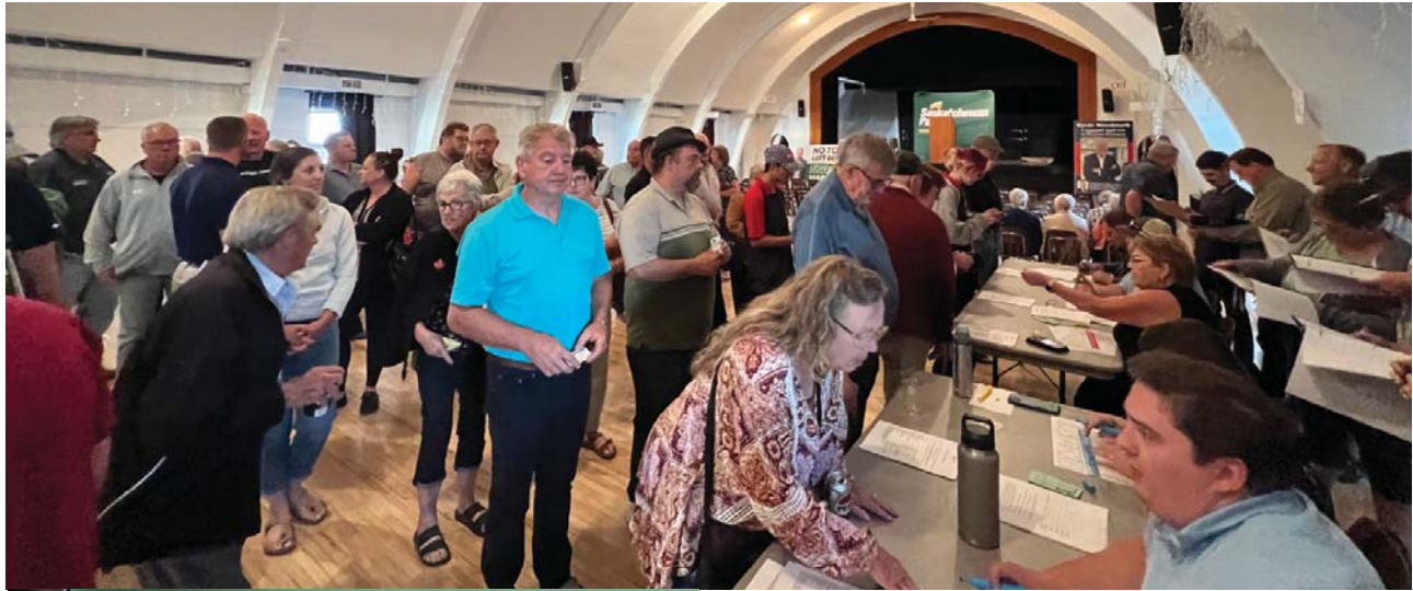
Above, the Grenfell Community Hall was packed throughout the night Tuesday as hundreds of people cast ballots for the three candidates for the Saskatchewan Party nomination.