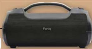
Foniq Apollo Speaker FO-Apollo