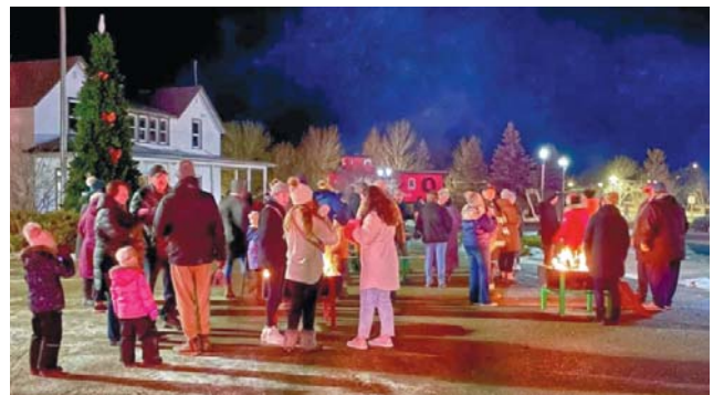
The above photos are scenes from last year's Light the Night at the Historical Park in Esterhazy.