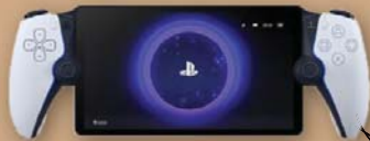
Play Station Portal Remote Player PS Portal