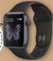
Boost BT Smart Watch Track it all BSW 1500