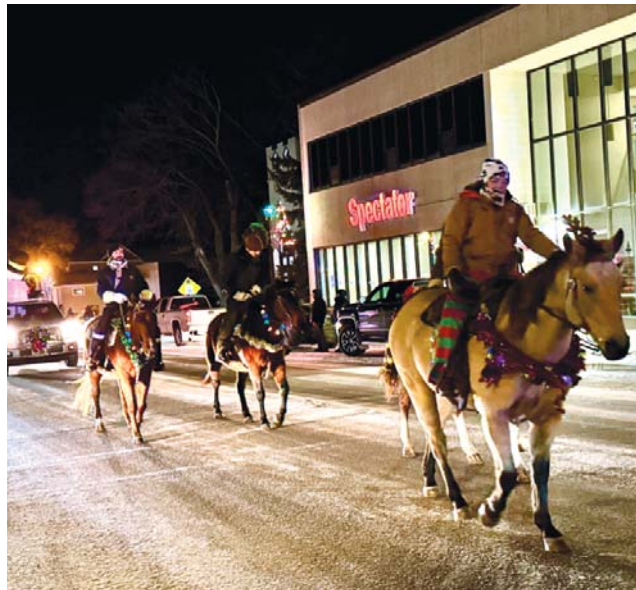
Horse riders during the parade last year.

The annual Kinnettes Santa Claus Parade is back, starting at 7 pm that night. Marshalling will begin at Bradley Park at 6:30 pm. The parade will head west on Wright Road, south on Main Street, east on Broadway Avenue, and then back on west on Wright Road and loop through the hospital parking lot.