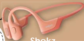
Shokz Open Run Pro 2 53673