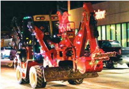
Left: Jeannot Electric's parade entry from last year.

Moonlight Madness Dec 5 • CP Holiday Train Dec 6 • Santa Day Dec 7 Twinkle Tour Dec 1-12 • Christmas Supper & Carol Festival Dec 8 • Santa Claus Parade Dec 19