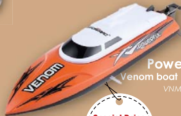
Power Boat Venom boat up to 25 km/hr VNM-PWBT