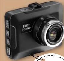
Escape Dash & Cabin Camera