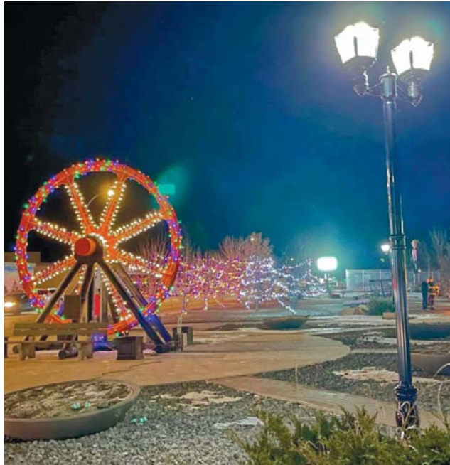
The Historical Park lit up in Esterhazy.