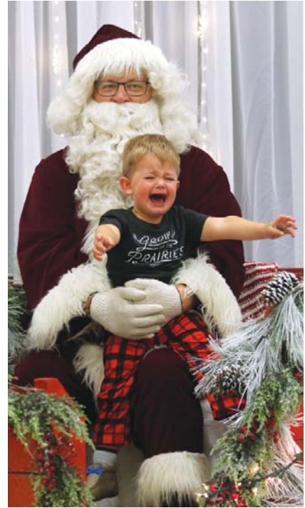
Right: A little boy wasn't happy to see Santa last year.