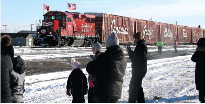
Above: A photo of the CP Holiday train going through Moosomin in 2022.